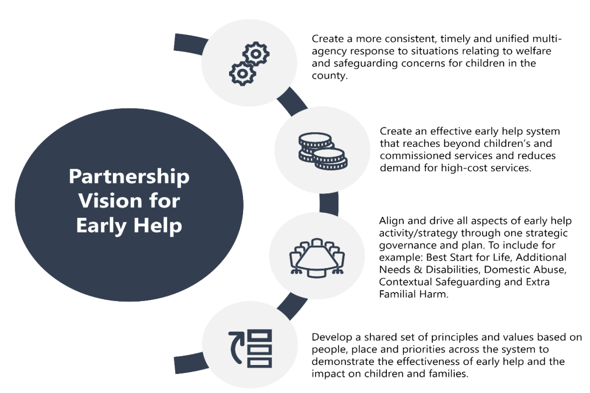
Figure 2 Surrey's Partnership Vision for Early Help

74. Therefore, the Early Help offer in Surrey is dependent on the contributions of all agencies, partners, and communities. When this is working well families can access a localised Early Help offer whether they are signposted and self-serve or are supported by practitioners for example, schools and early years settings, Police, GPs, and other health services to get the help they need. The Council's Early Help offer is a mixed economy of in-house and commissioned provision. The Family Centres offer is currently delivered by schools and voluntary community and faith sectors (VCFS). Mentoring services are also delivered by VCFS partners. Further details on Surrey's current commissioned Early Help offer can be found in annex 1.